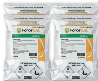
4 bags/80 acres