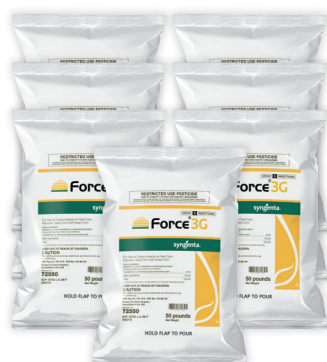
7 bags/80 acres

Force 6.5G has the lowest per acre rate of formulated product in the granular bag segment.