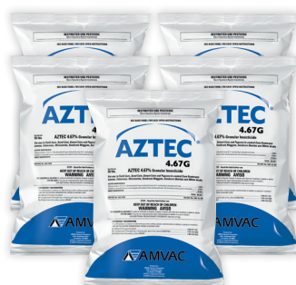
5 bags/80 acres